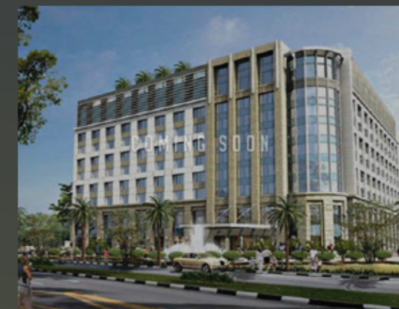
Icon at Ranjit Avenue