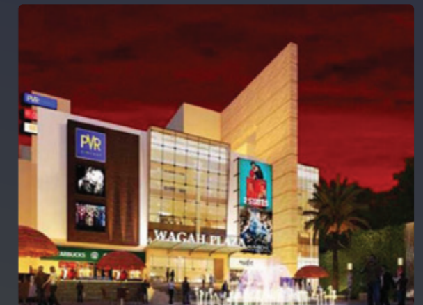
Soul Space Spirit Mall