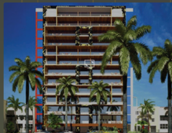
Sky Villa & Beverly Park